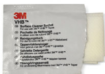
CL-W01 x 1